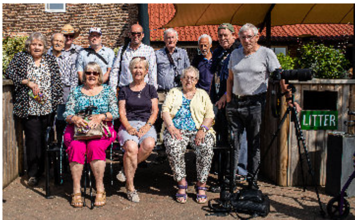
Club Members and Guests at the Yorkshire Wildlife Park visit- June 2019